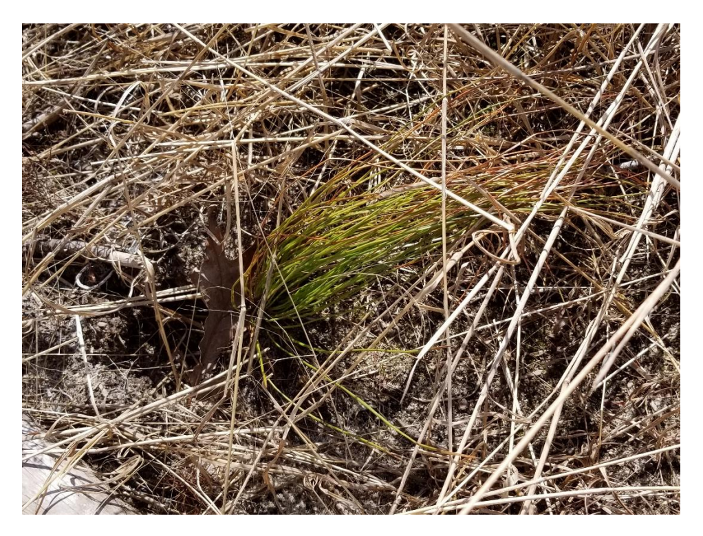
This is what a baby pine looks like.