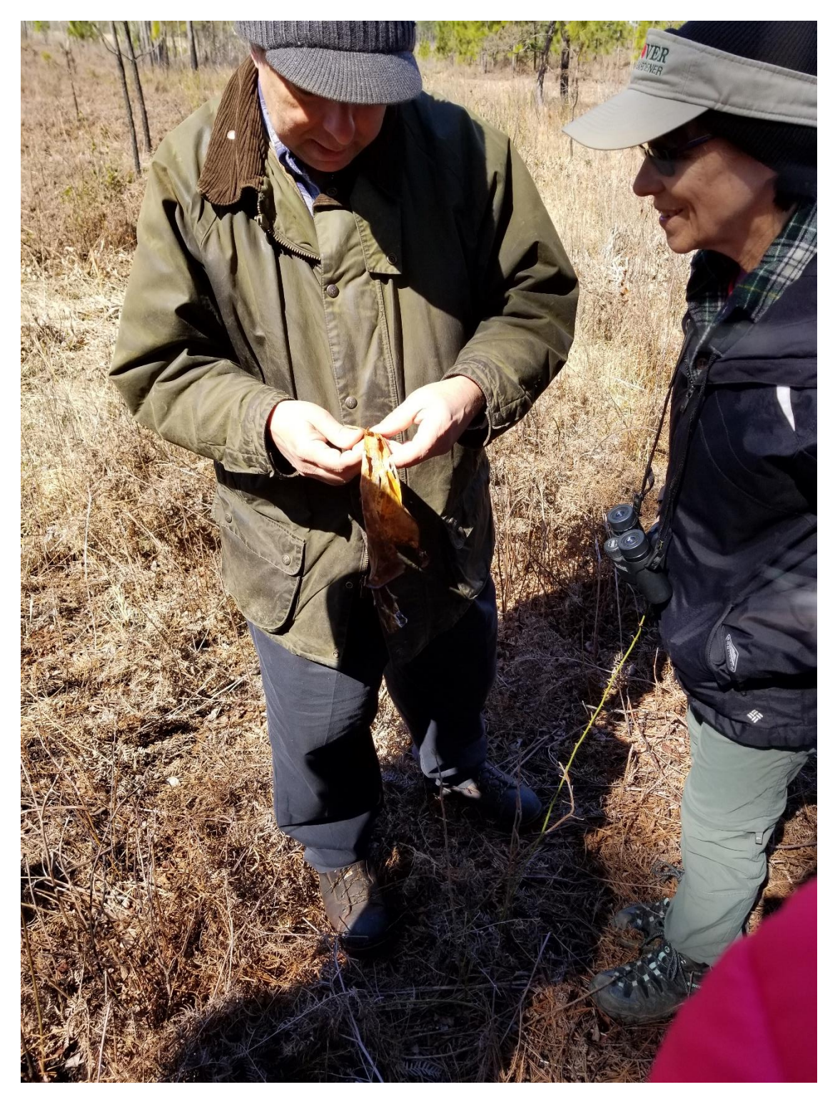
This of course is the dormant season for the pitcher plants so we could only see carcass of the plant from last season.