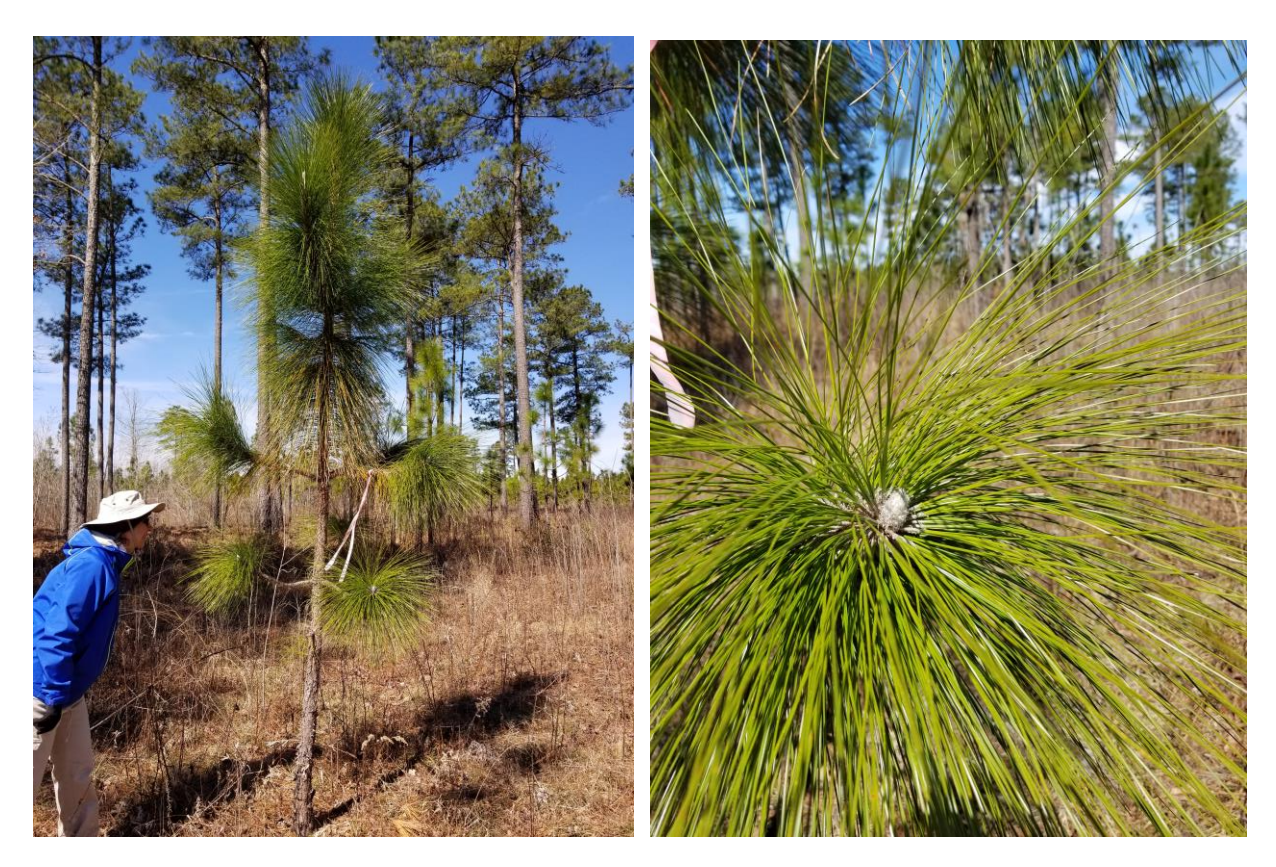
Taking a closer look.