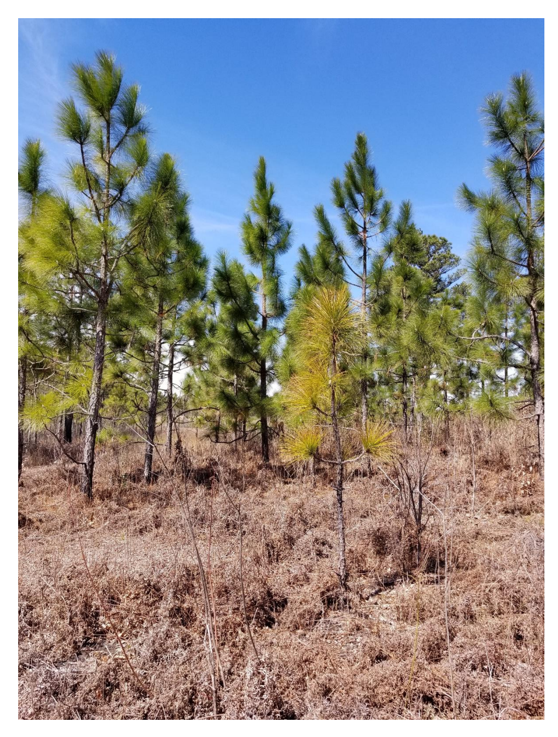
A beautiful stand of the long leaf pines.