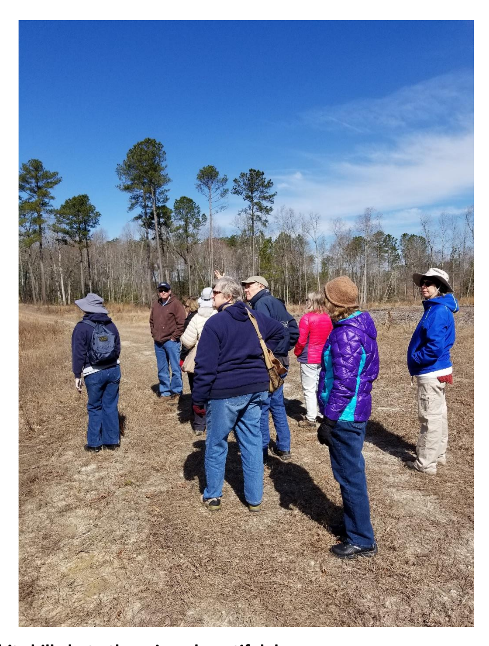
It was a bit chilly but otherwise a beautiful day.