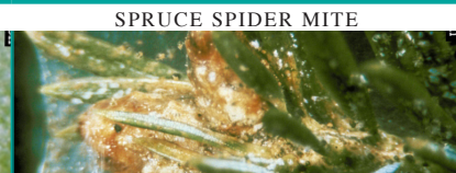
SPRUCE SPIDER MITE

THOROUGHLY WET THE FOLIAGE AND STEMS WITH A FULL COVERAGE SPRAY.