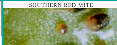
SOUTHERN RED MITE

CHEMICAL: ACEPHATE, CARBARYL, DIMETHOATE